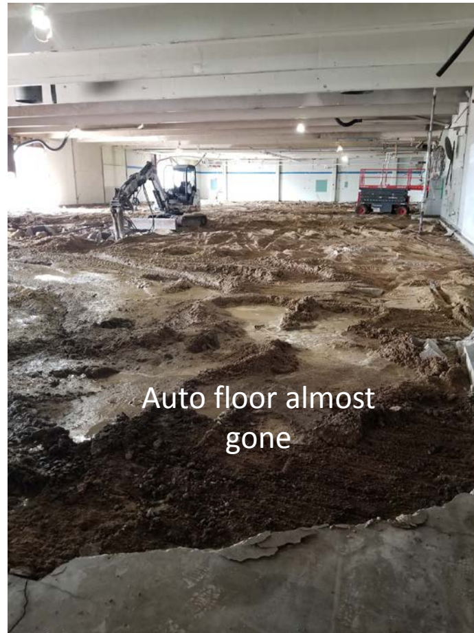
Auto floor almost gone