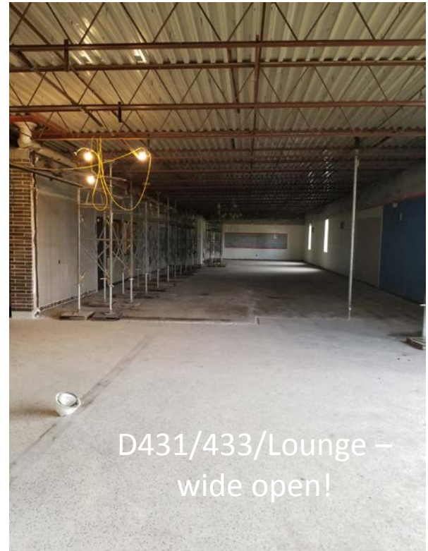
D431/433/Lounge – wide open!