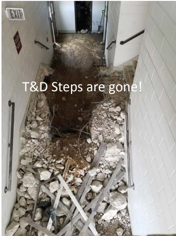
T&D Steps are gone!