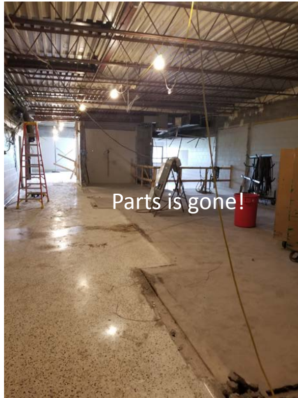
Parts is gone!